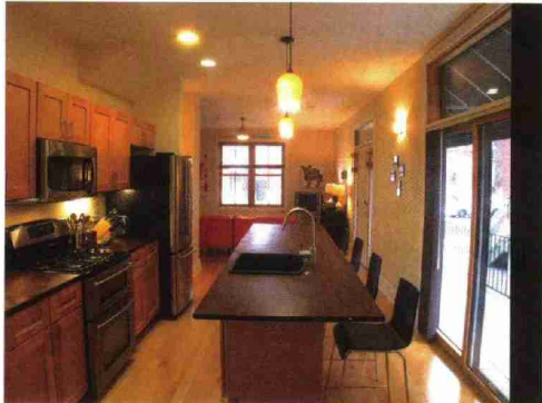
3105 Magnolia Ave. Tower Grove East $199,900

Contact: Vickie Hollenbeck, Coldwell Banker Gundaker , 636.343.1500.