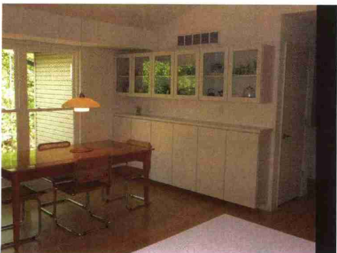
3103 Painted Horse Dr. Byrnes Mill $285,000