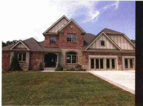
1479 Ivy View Ct. Fenton $849,900

In real estate, the old adage is—and always will be—location, location, location. But today, an increasing number of homebuyers are not only searching for a home that is in a neighborhood they love, but also one that reflects their lifestyle. A growing trend among would-be buyers is moving toward a more environmentally responsible approach. St. Louis real estate agents have numerous options for buyers looking to save money while helping preserve our planet. Here are just a few green listings currently on the St. Louis real estate market.